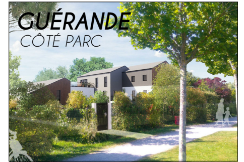
Plan du R+2